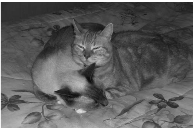
Charlie & Twinkie

While the cats were in isolation, every surface in the rest of the house had to be completely vacuumed to pick up spores, and wiped down with a bleach solution wherever